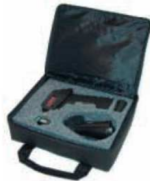
Supplied in a case with all the required accessories

The turbulence generates a broad spectrum of sound. There are ultrasonic components in the sound and since the ultrasound will be the loudest by the leak site, the detection of these signals using the LOCATOR ® is usually quite simple.